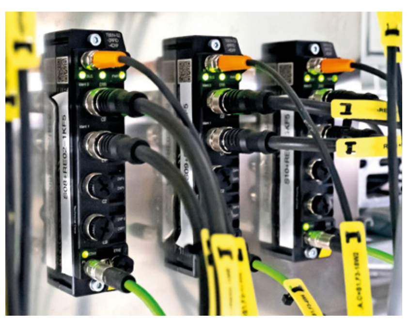
Turck's TBEN RFID interfaces with IP67 protection are screwed onto a metal panel in a cabinet-free installation in the warehouse

A robot takes over in the treatment process the dynamic removal and placement of the boxes on the appropriate shelf location. As a result of the production team's previous experience, the new solution focused on contactless power and signal transmission: